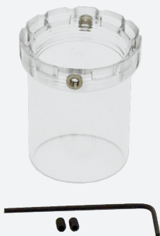
Torque Fixing Ring KC-7C

Cover torque adjustment nut to deter tampering (1 included with driver)