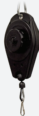
Spring Balancer KL-1200

Attach to workbench, safely holster driver when not in use (for tool without torque fixing ring)