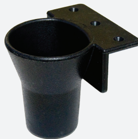
Suspension Rack KH-2L

Cover torque adjustment nut to deter tampering (1 included with driver)